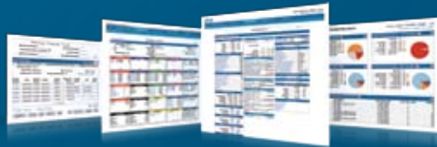
Evolving to Meet Your Changing Needs.

Through careful planning and development, close relationships with our customers, integration of new dealership practices and building on a rock-solid foundation, PFW IntelliDealer has evolved into the full-service, reliable solution for John Deere dealerships!