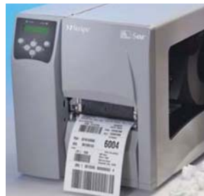
Note: Currently, the S4M is the only model supported by PFW IntelliDealer

At the heart of IntelliDealer's Label Printing Solution is the Zebra S4M direct thermal/thermal transfer printer. Constructed of metal, the Zebra S4M is suited to the harsh dealership environment. This label printer can print up to 6" (152mm) of the label roll per second, which means less time waiting for your labels and more time applying them.