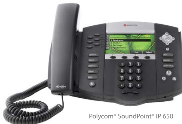
Polycom® SoundPoint® IP 650

Managed phone service with a simple price and no hassle